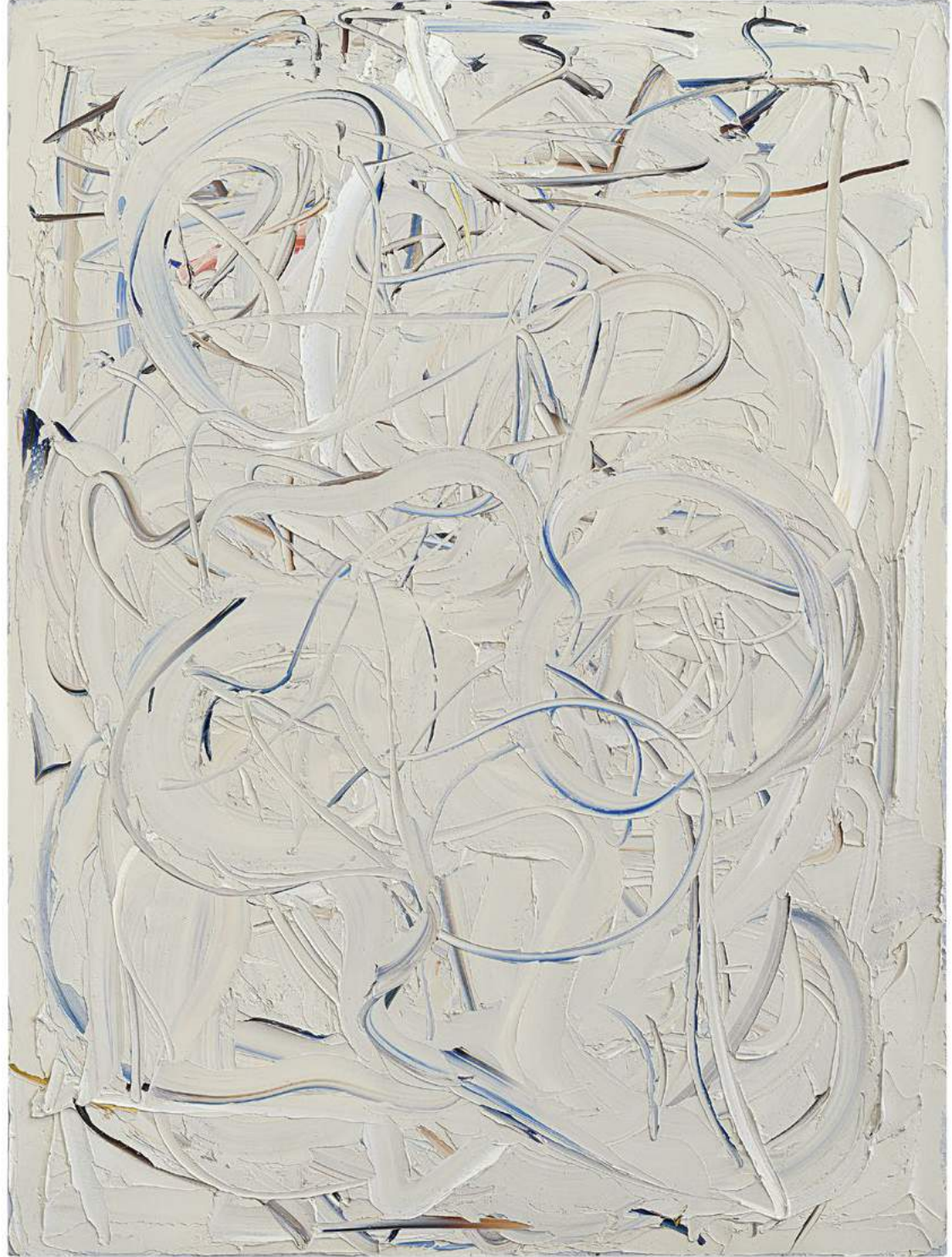
Portrait I , 2021 Oil on linen 80 x 60 inches 203.2 x 152.4 cm