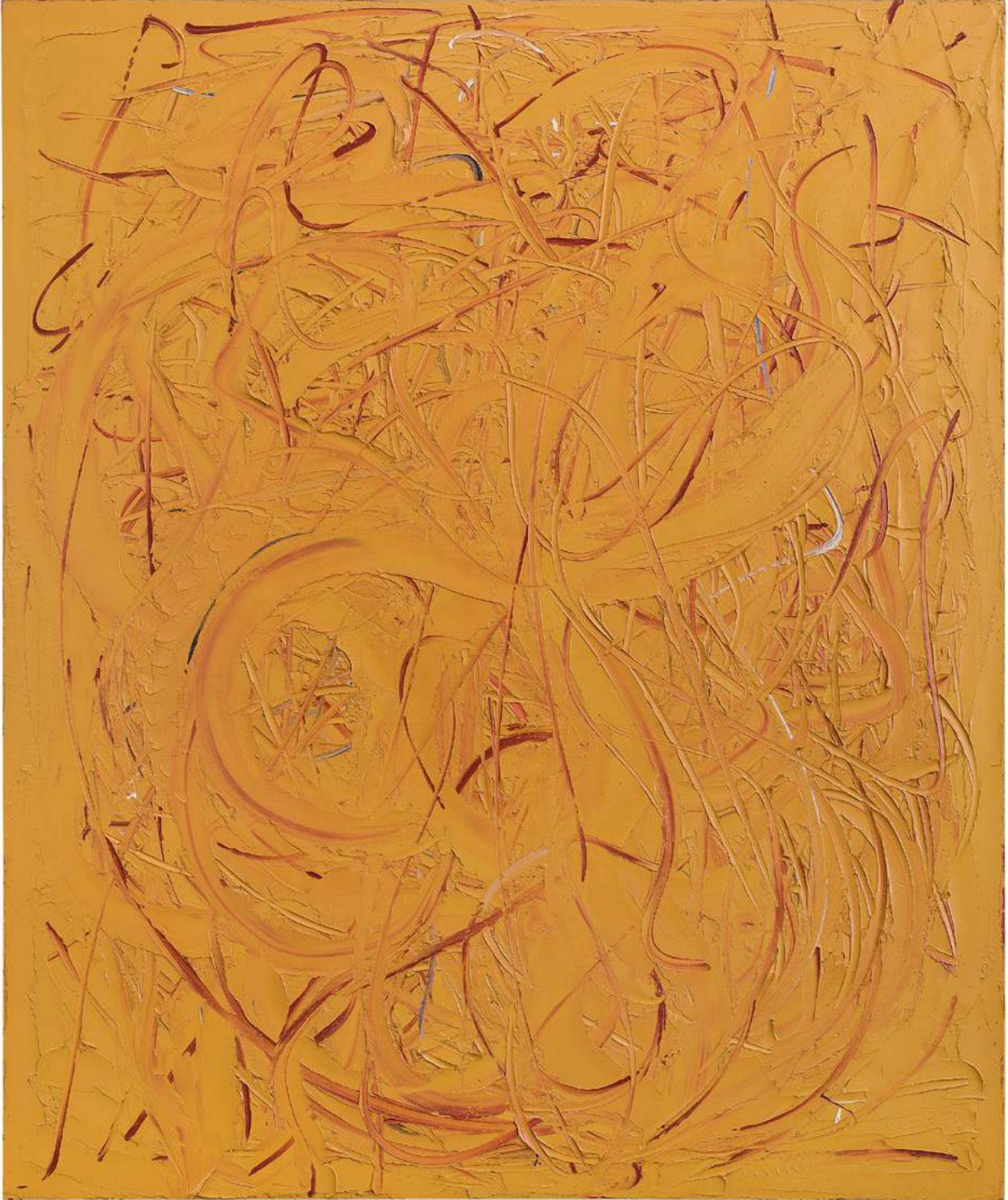
Solar , 2021 Oil on linen 82 x 68 1/2 inches 208.3 x 174 cm