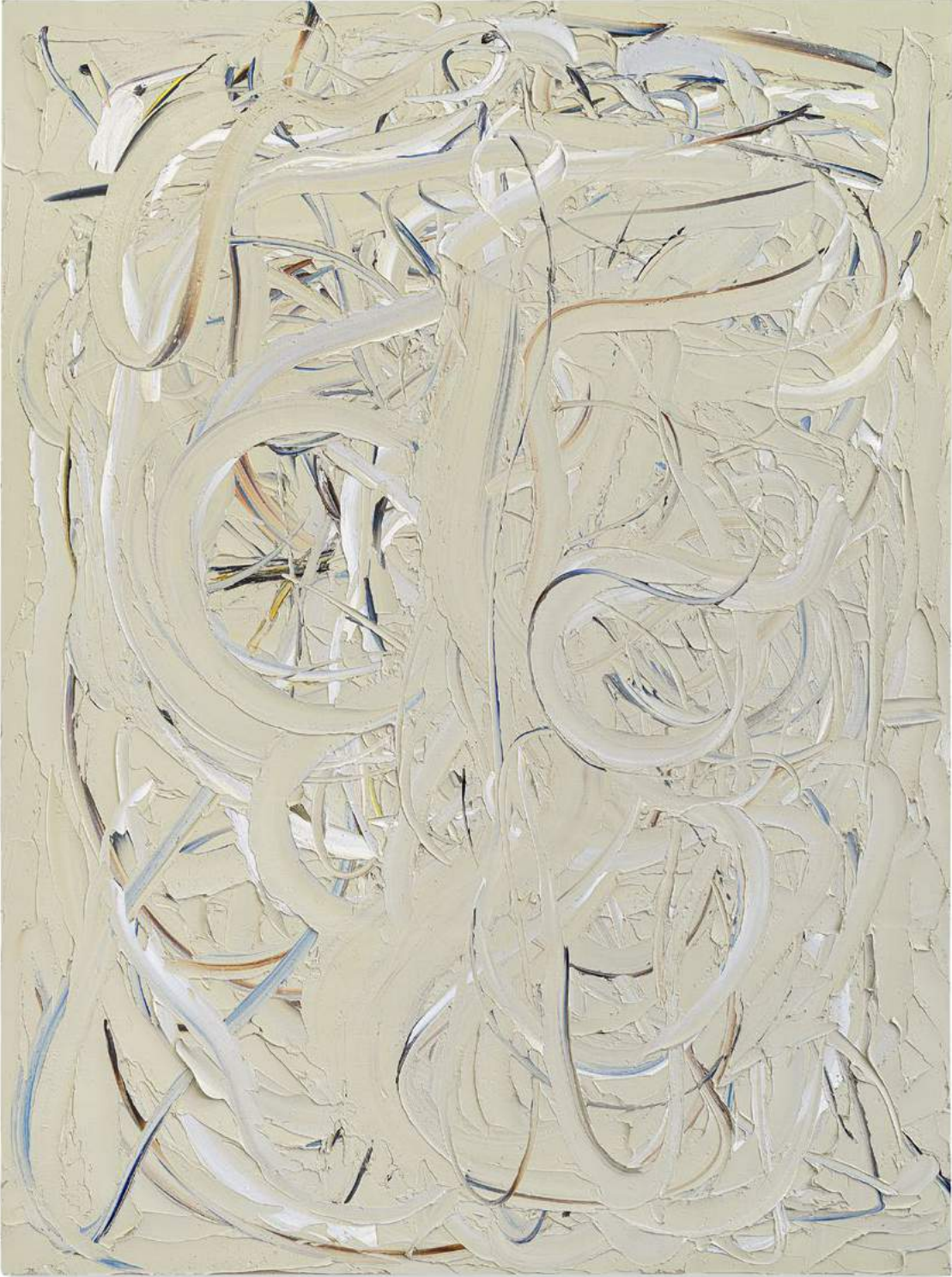
Portrait II , 2021 Oil on linen 80 x 60 inches 203.2 x 152.4 cm